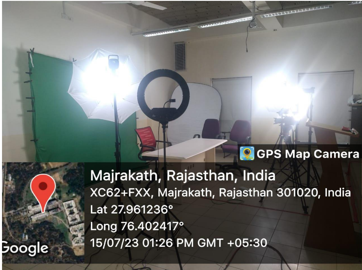
Figure 5 CR226 has professional video lights, ring lights, Green Screen, Professional Camera, Professional Mic to record faculty lectures