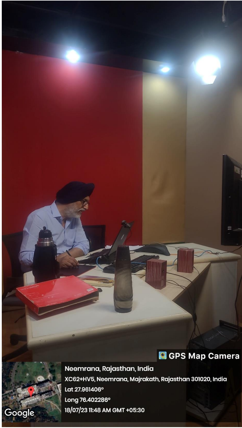
Figure 3 Teacher taking a live session from AV Studio 1