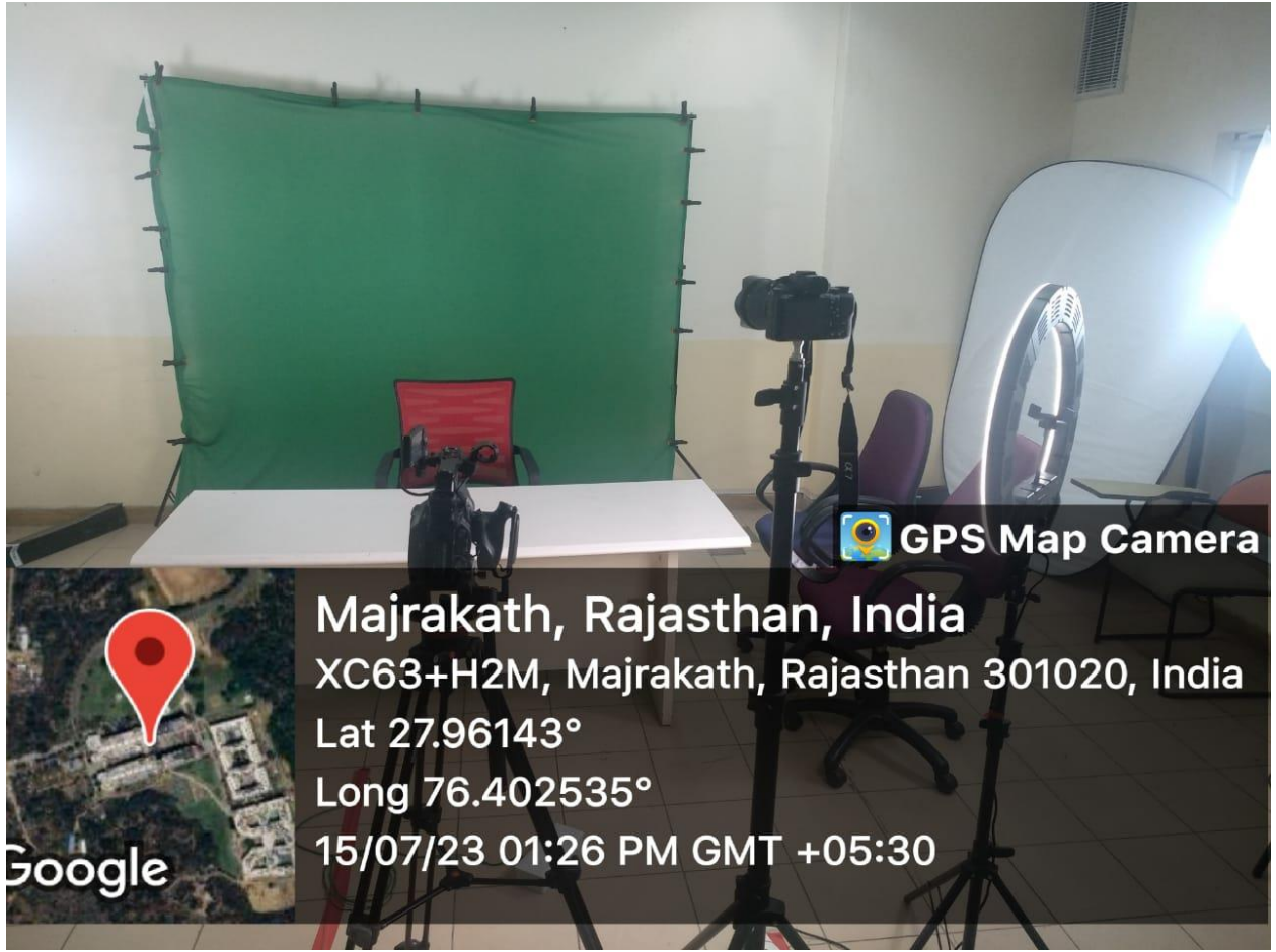
Figure 6 CR226 from another angle