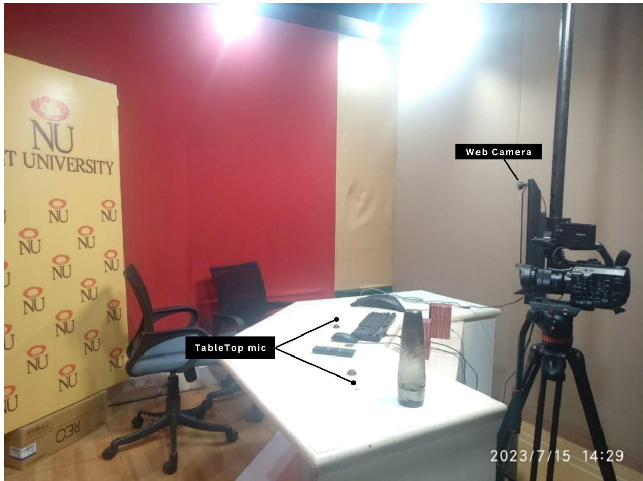
Figure 2 Audio Video Studio 1 equipped with Studio Lights, dedicated PC with Internet connection, A web camera to join online meeting, tabletop mic