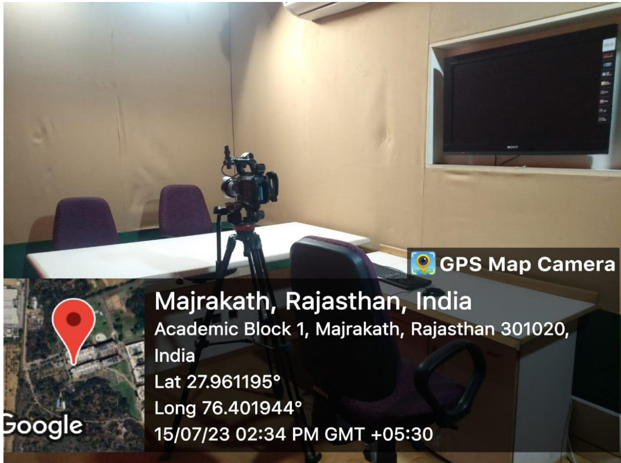
Figure 4 Audio Video Studio 2 is equipped with Desktop, mic, camera, studio lights to conduct online meetings and video recordings