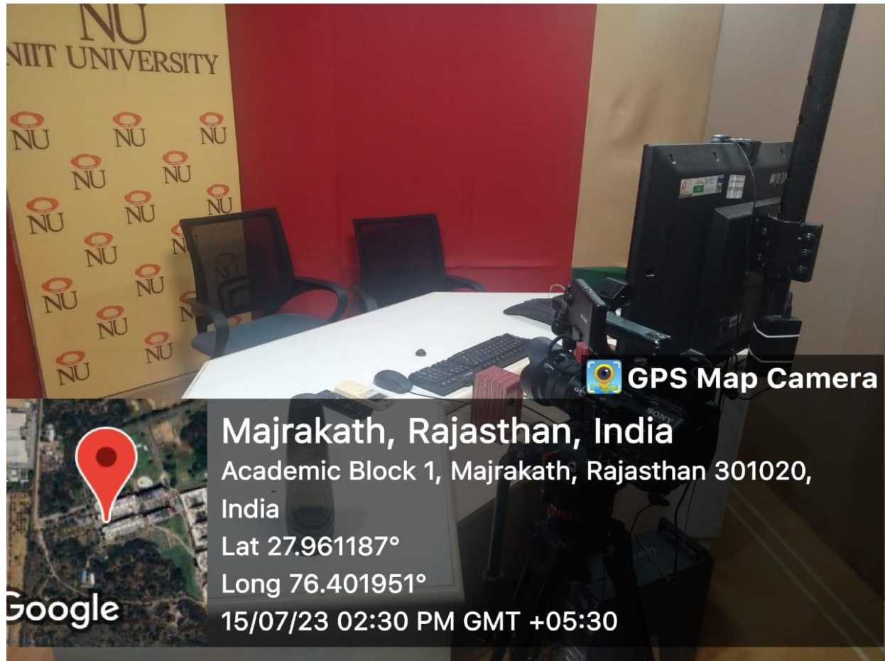
Figure 1 Audio Video Studio 1 equipped with Studio Lights, dedicated PC with Internet connection, A web camera to join online meeting, tabletop mic