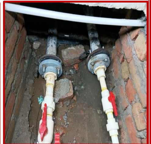
New HDPE pipeline work for PG-1 & PG-2 hostel