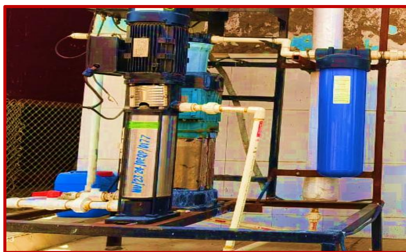
250 LPH RO PLANT