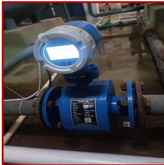
Electromagnetic Flow Meter with Telemetry