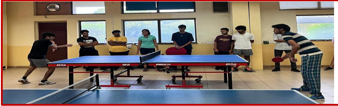
Inter-house Yoga Tournament: