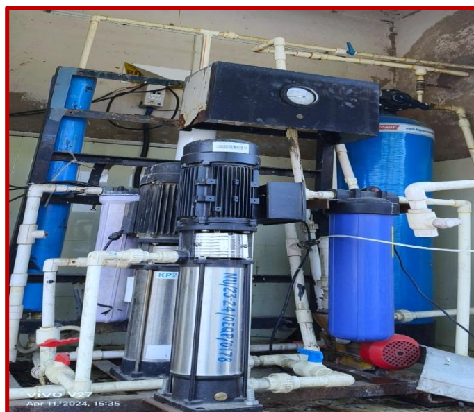
250 LPH RO PLANT