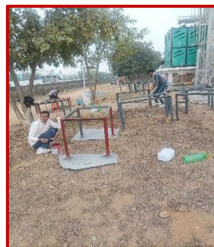
New Dining Tables for Dining Halls.