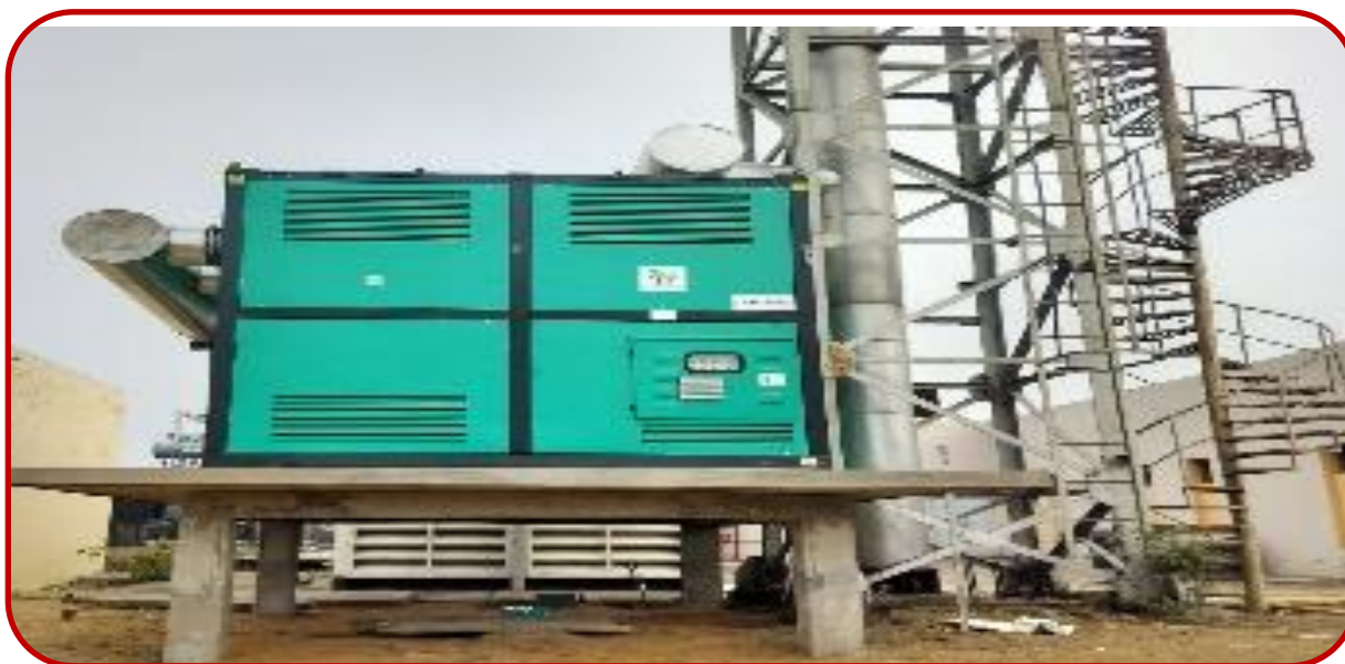
RECD FOR 1500 KVA DG.