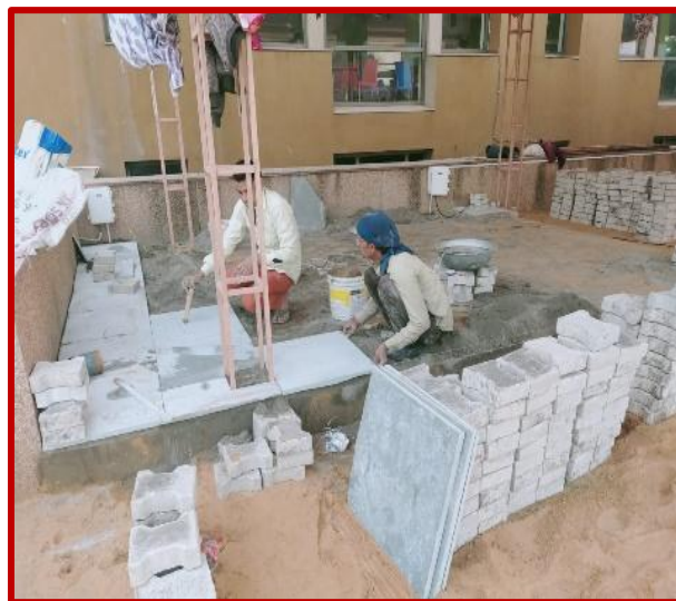
Flooring work of DH-4