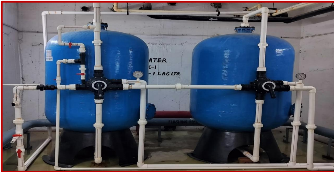
WTP - (Water treatment Plant – 250/ Regeneration)