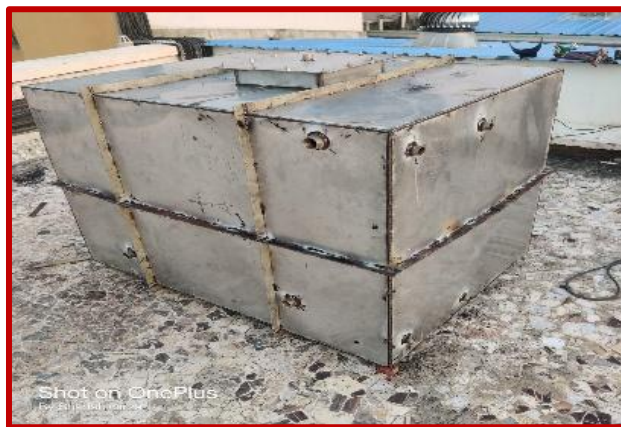
New SS Tanks for UG-2 Hostel