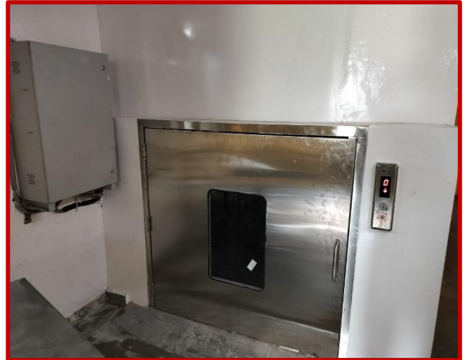
Dumbwaiter Capacity 250KG